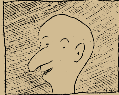
"HE'S A PIP!"