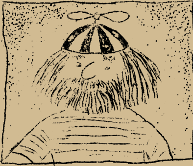
"HE'S A TRUFAN!"